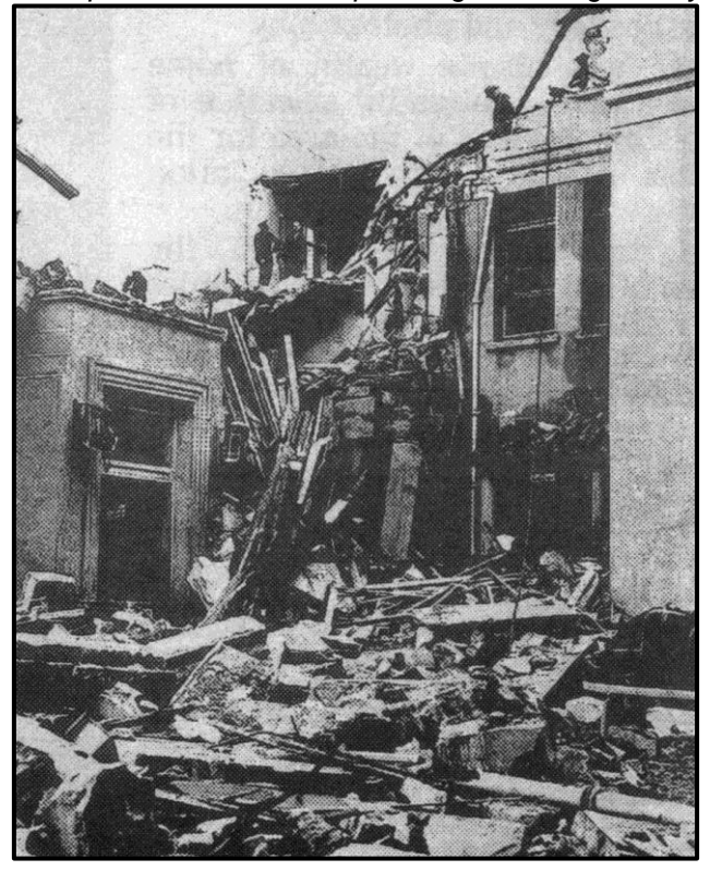
Above shows the extensive damage at the Royal Cornwall Infirmary in Truro after the bomb was dropped.

mother and father had just arrived at Truro having travelled up from Penzance. They left the train, crossed the railway bridge and were almost at the Booking Office when the enemy struck. Overflying the Highertown area, the FW190 aircraft came in from the west with the sun behind them and attacked Truro railway