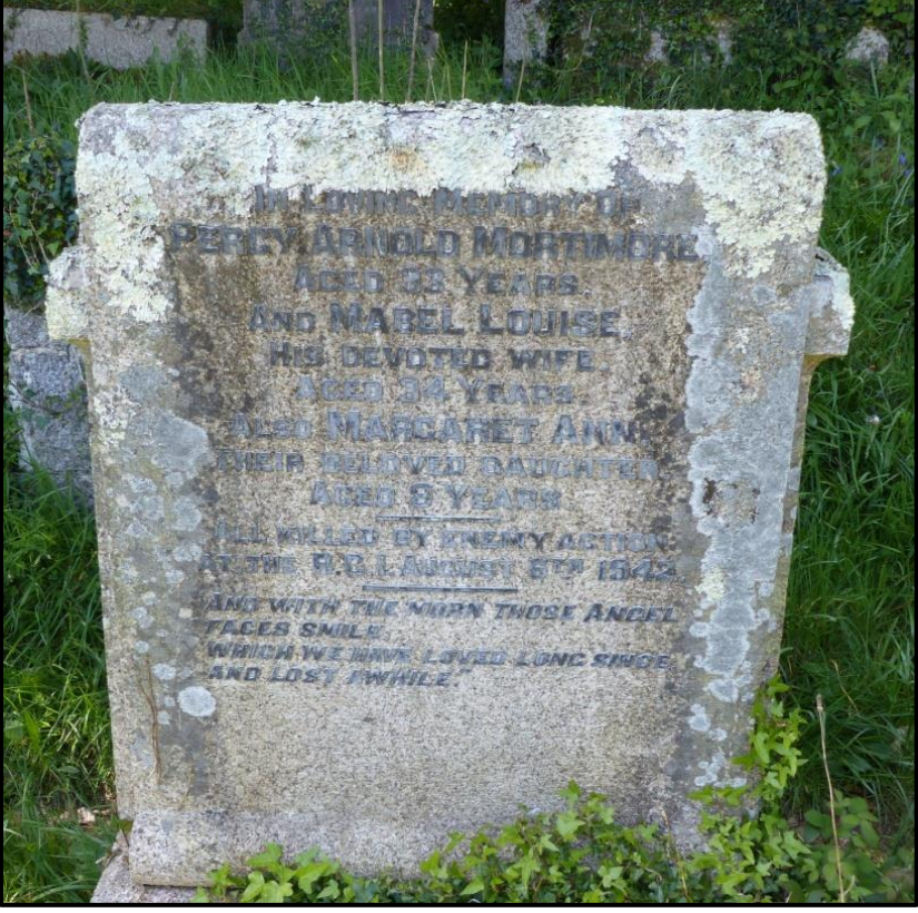
The Mortimore Gravestone in Kenwyn Churchyard Cemetery, Truro. The wording on the grave makes no mention of Percy's ROC membership but does give details of the manner of the Mortimore's family death.

Road, a total of 14 persons. 65 were injured and over 100 houses were damaged. Three houses were demolished. No enemy aircraft were intercepted by RAF fighters, none were shot down and all the air raid warnings had come too late. Overall the 10/JG2 Jabo still very much had the upper hand.