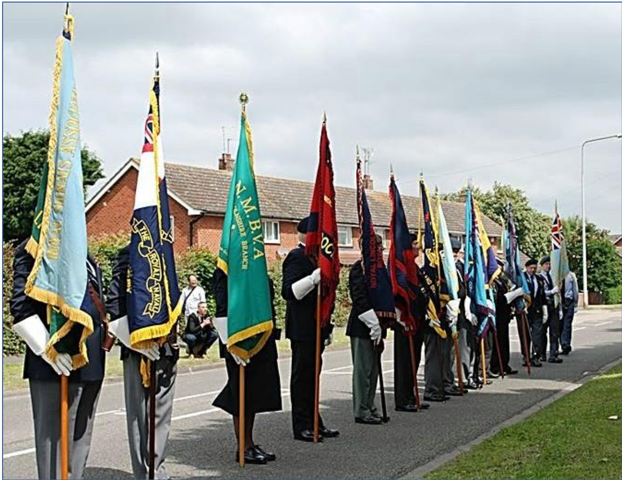
Waiting for the Service to begin