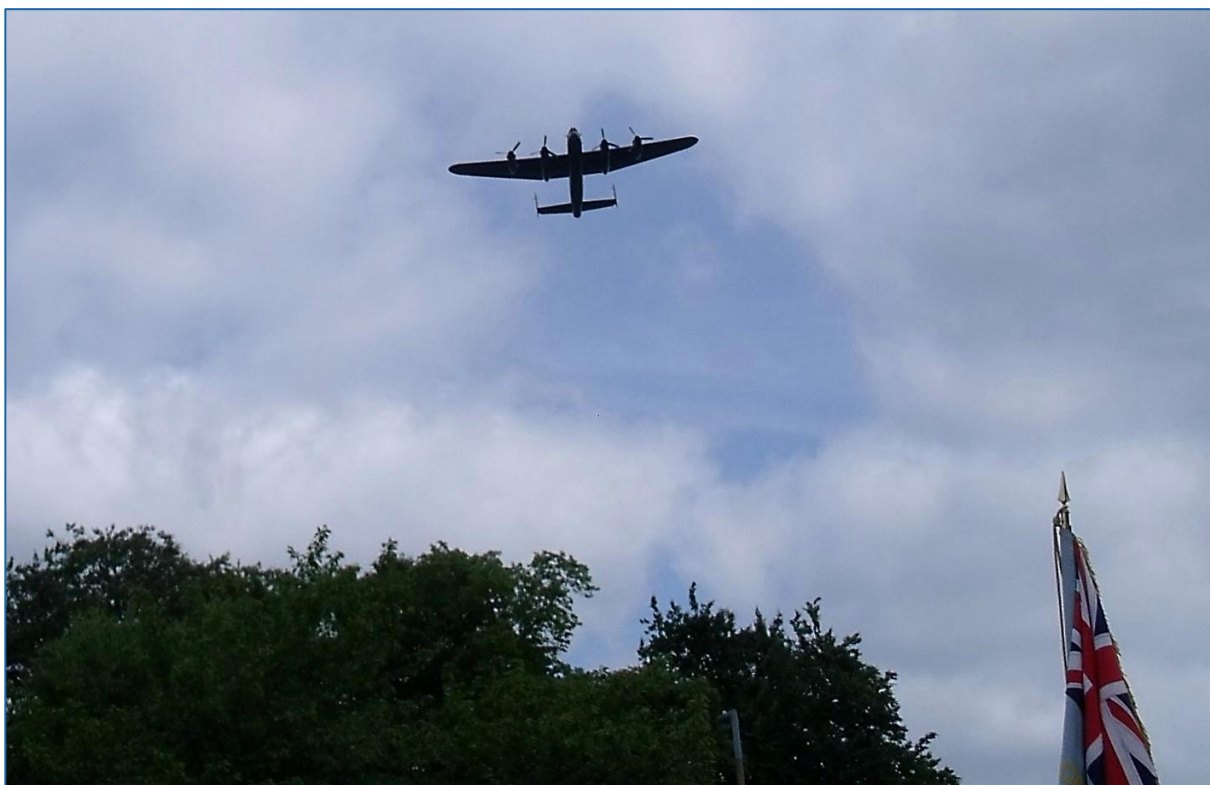
The RAF BBMF Lancaster flies again over Skellingthorpe – “The unforgettable sight and sound of the Lanc.”