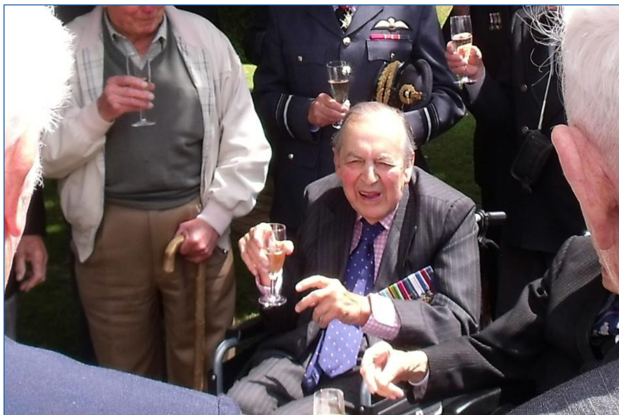
Former Marshal of the Royal Air Force Sir Michael Beetham GCB, CBE, DFC, AFC, DL RAF (Rtd.) who celebrated his 90 th Birthday on the day.