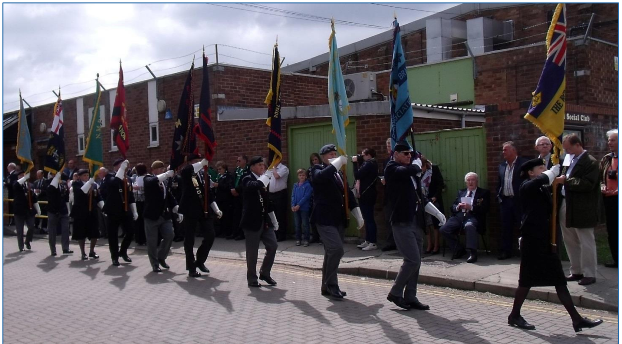
The Standards march off.