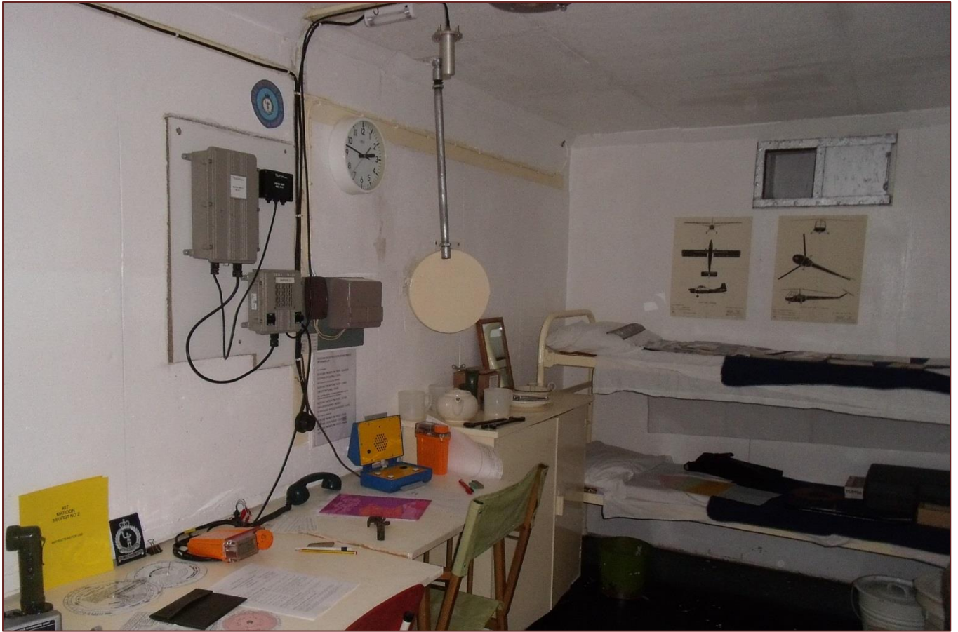
The interior today