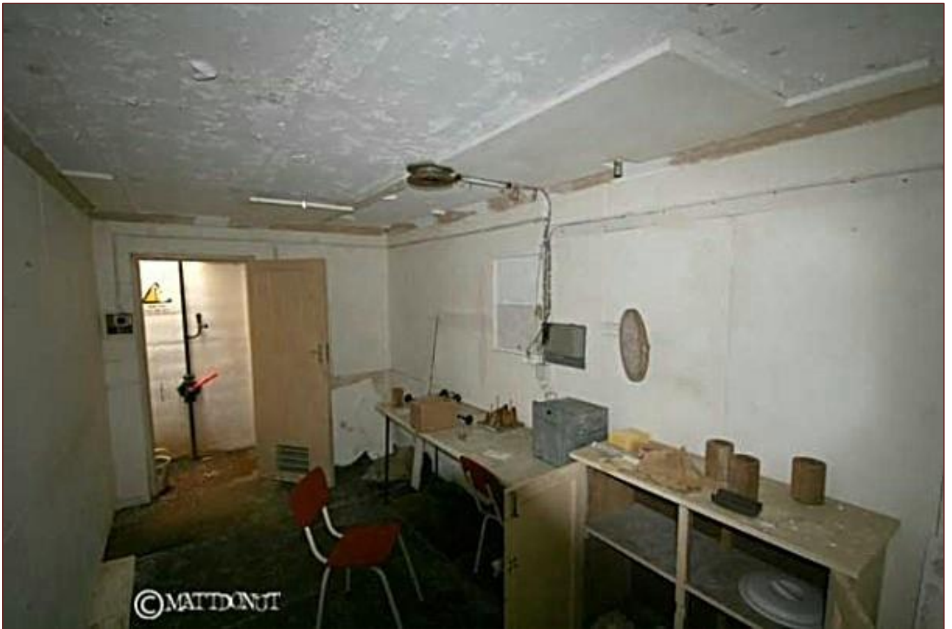
The site in 2013