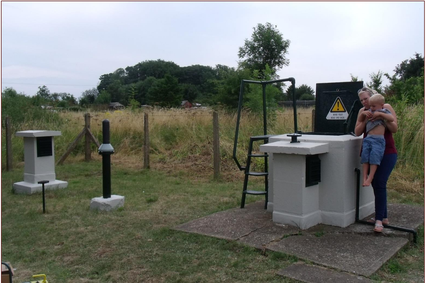
Above:- "No you can't go down there!"