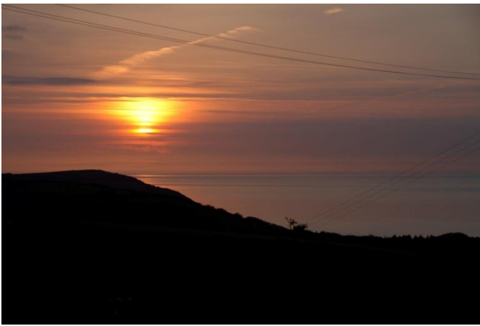
Bristol Channel April sunset