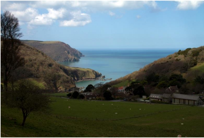
Woody Bay with Lee Abbey in Foreground

Wife and I to Lynton in Devon for long weekend. Great area and Site.