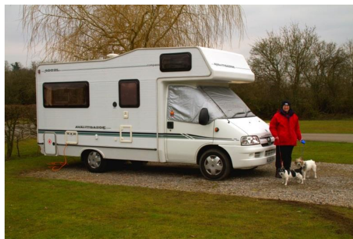
'Millie' with the 'Boss' and girls.