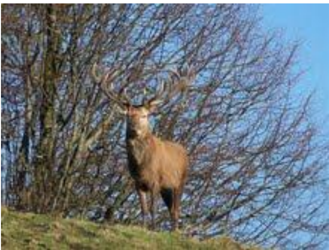
Picture of a stag