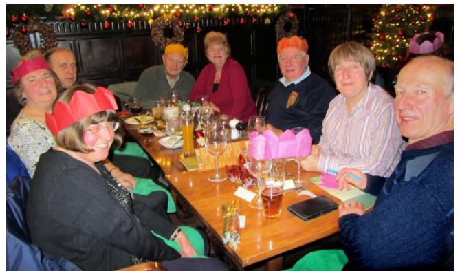
In festive mood