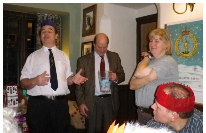
Starting the 'Main Event'