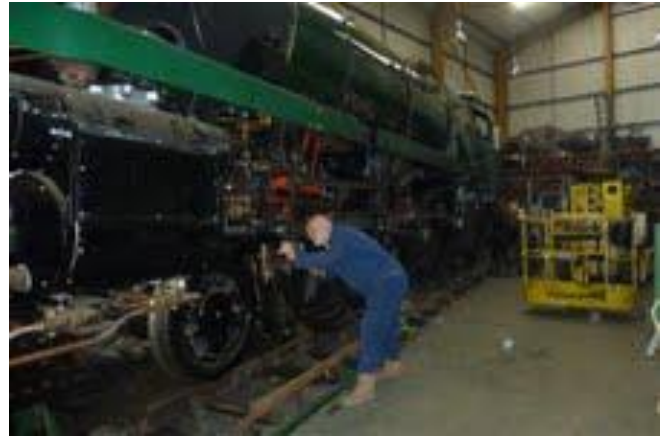
Brian gone loco

LETS HAVE MORE GENERAL INTEREST CONTENT AND PICS PLEASE