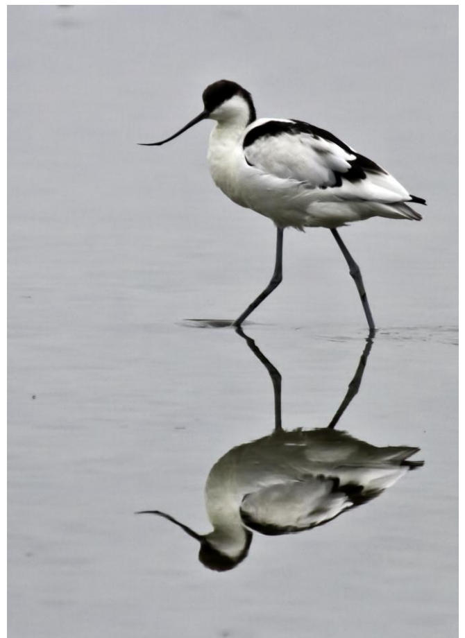
Avocet taken at Brownsea Island in October.