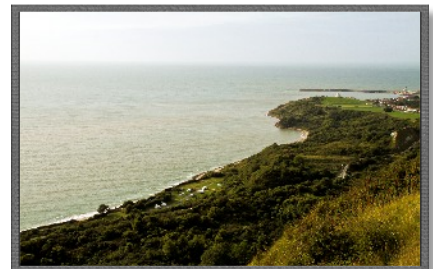
Club site viewed from rear of Memorial Site.